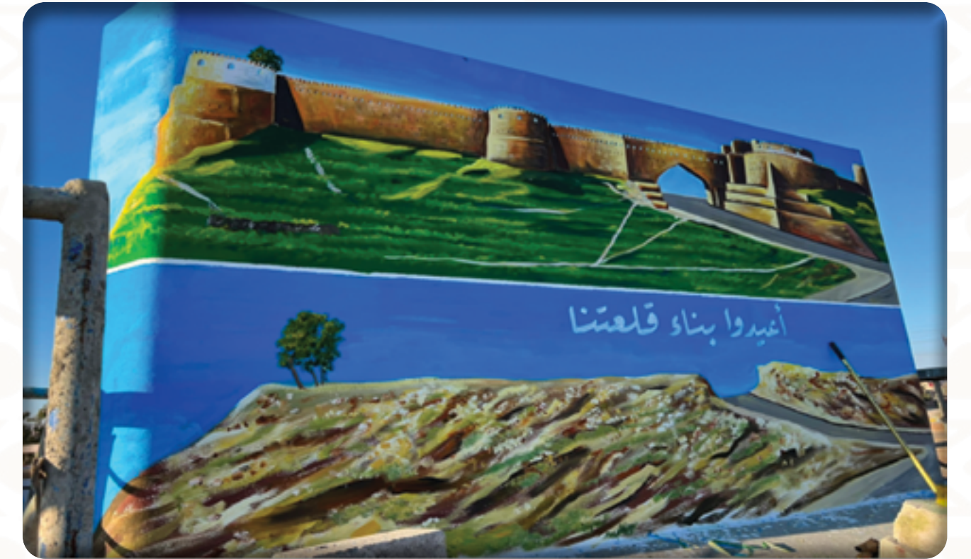
© Arts have Language & CPI

The Talafar Citadel Mural, created in December 2022 by young artists, symbolizes the revival of Talafar's rich 3000-year heritage. Destroyed in 2014, the citadel's reconstruction with support from UNESCO unites communities in preserving and celebrating their cultural identity.